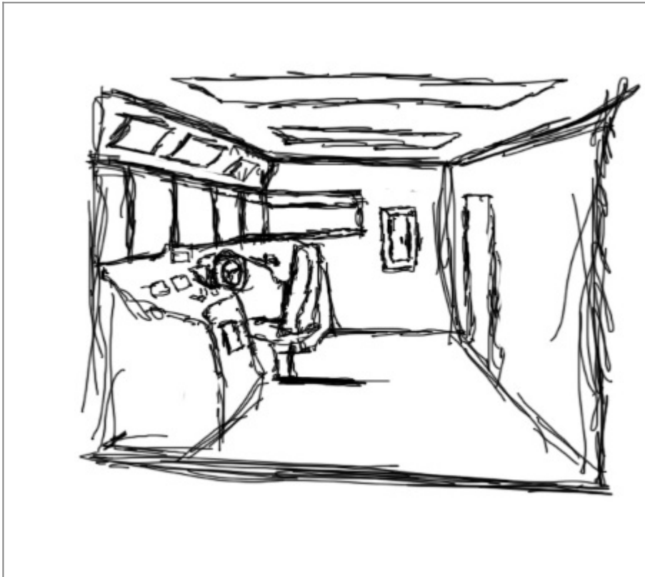
Conceptual Art Of The Standard Compartment

The spacious driving compartment is sectioned off from the rest of the Sandcrawler with a single door as the only entry or exit point unless it is an emergency in which case an emergency escape hatch is located on the ceiling with a ladder attached to climb out. The compartment itself is usually quite spartan, Ahmida typically leaving it up to the consumer to decorate or modify at their discretion. The sole item of the compartment they tend to expend effort on is the driver's seat. The seat itself is genuine Herditan Leather with arm rests. The material within the seat is typically a form of memory foam that conforms to the driver's body providing ample comfort during the long treks.