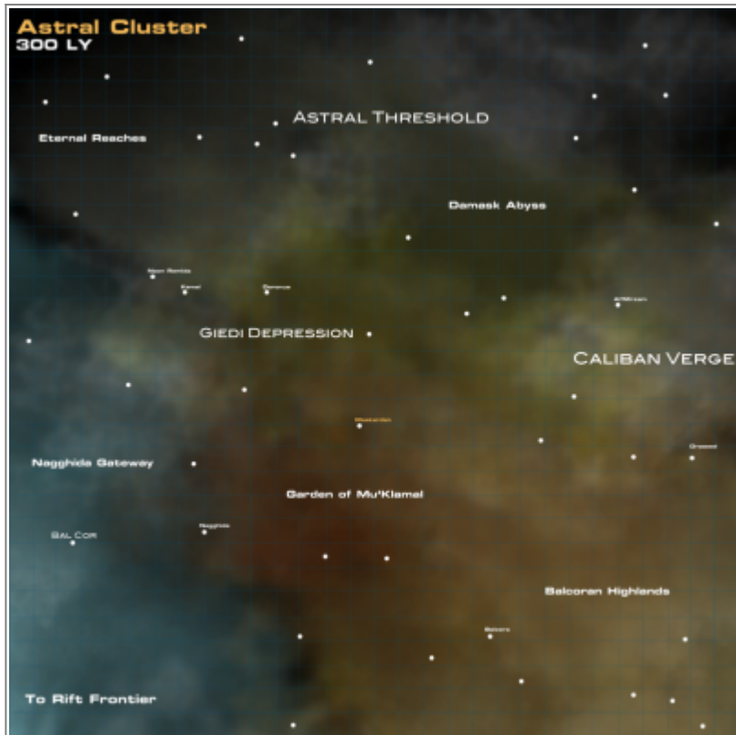
Astral Cluster: (-580, 807) from Kiyko Sector

The Astral Cluster is a massive, largely uncharted star cluster that is the home to the reclusive and isolated Iromakuanhe race, as well as other, lesser known civilizations. It is named after the Iromakuanhe Astral Commonwealth , the de-facto superpower of the region.