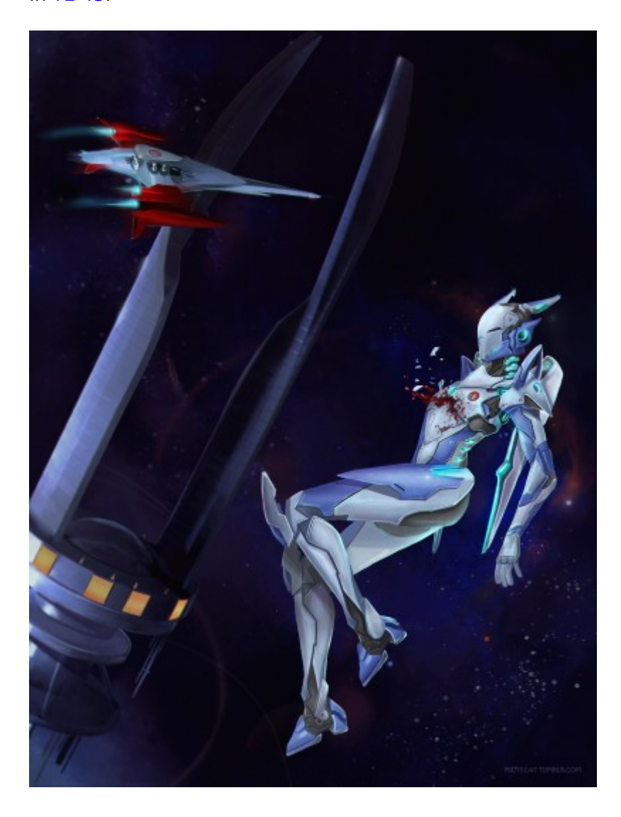
Origins of the War

The Kuvexian War is the current name of an armed conflict between the Yamatai Star Empire and the Interstellar Kingdom Of Kuvexia and their various vassal states and species. It began in YE 38 and ended in YE 43.